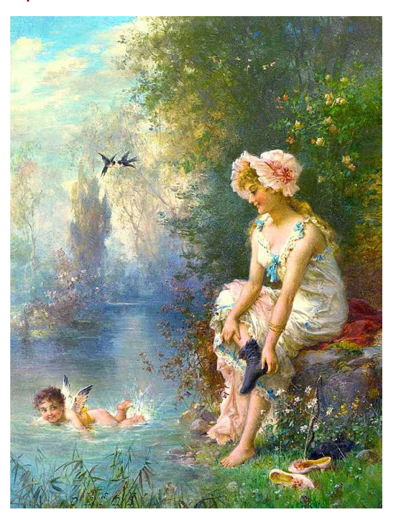
Chapter 1.1- Poems on Cosmic and the Individual